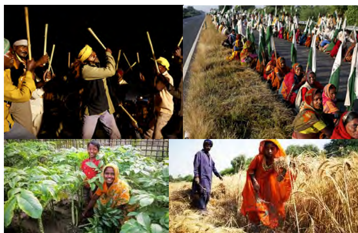
Small scale farmers (India)

Small farmers around the world are losing their lands at an accelerating rate. India and Brazil are among the worst hit. With the loss of their livelihood and nowhere else to go, they flock to city slums. Without traditional community supports, they become easy prey to crime and violence.