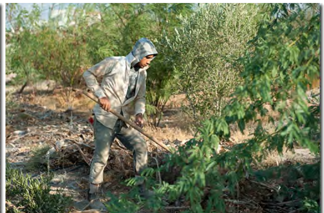
The all-important mulching underway at the JVPP site in the Dead Sea Valley