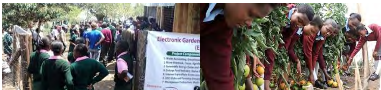
Seanet, Kenya, WAF Award Highly Commended 2014