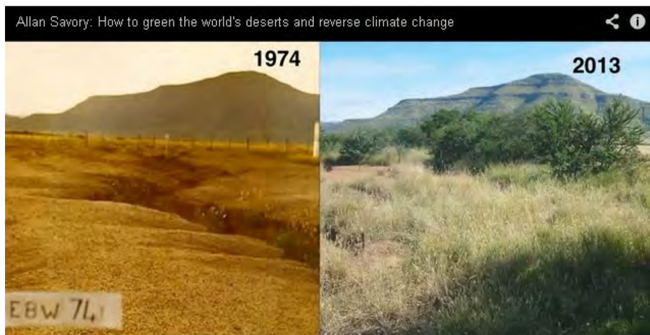
African Centre For Holistic Management, Victoria Falls, Zimbabwe, Africa (a Savory Institute Hub)

Five billion hectares suffer desertification from agricultural and pastoral degradation. One billion hectares of restored land can sustain the livelihoods of many people. It can also capture 11 billion tons of CO a year.