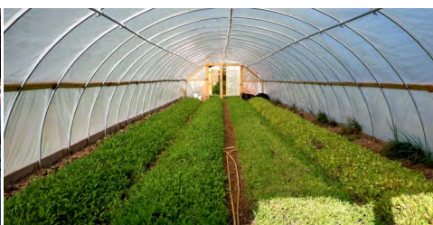
Growing Power, Milwaukee, Wisconsin, USA - WAF Highly Commended 2014