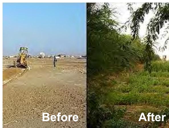
Permaculture Research Institute, Award Winner 2010

Participatory and explorative dialogs among impact investors, institutions, companies, country representatives and NGOs will focus on creating innovative business models and action plans.