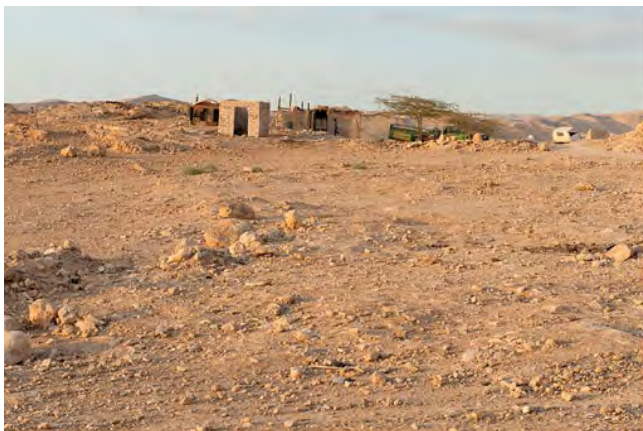
A Dead Sea Valley family home with their typical front 'lawn'

Award winning initiatives demonstrate considerable potential for a return on capital: financial, natural, social and human. Accordingly, action plans will include a new capital model for impact investing on the massive scale required.