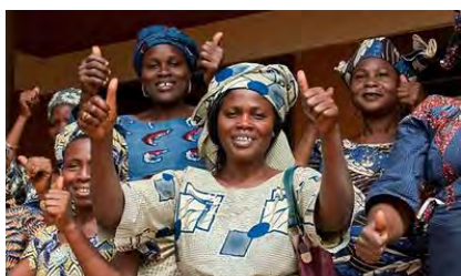
The Hunger Project, WAF Highly Commended 2010

Participatory and explorative dialogs among impact investors, institutions, companies, country representatives and NGOs will focus on creating innovative business models and action plans.