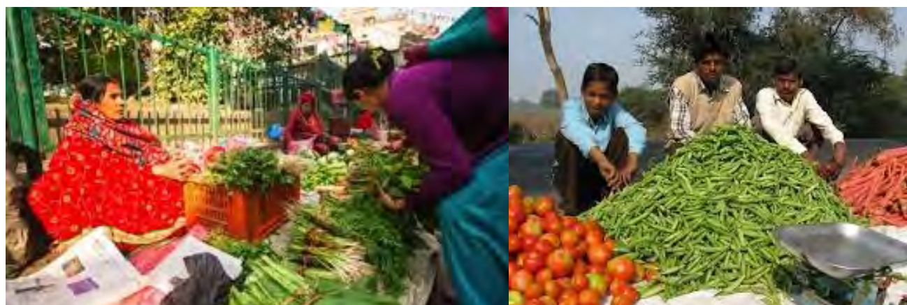
Selling their produce at markets

This EXPO-WAF forum will combine the expertise of proven initiatives, like those mentioned in earlier sections, with companies and investors. The resulting synergy will lead to land regeneration, sustainable agriculture, stable livelihoods, and dynamic business opportunities.