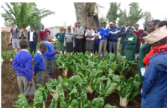
Seanet, WAF Highly Commended 2014