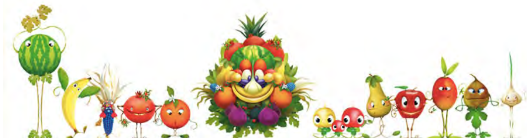
Official EXPO 2015 Milano Mascot by Disney Italia

WAF media and production partner, Cloudburst will stream the forum live via the web, cable TV and the UN network to 2000 + organisations. News services will receive highlights.